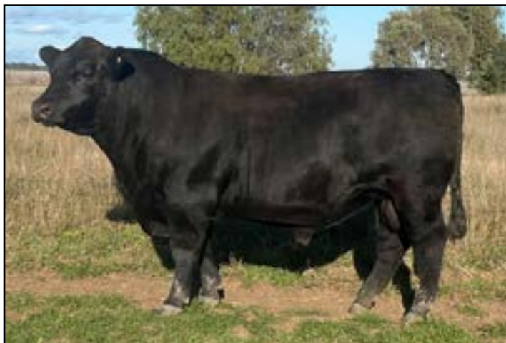
LOT 3- WAITARA BEAST MODE R29