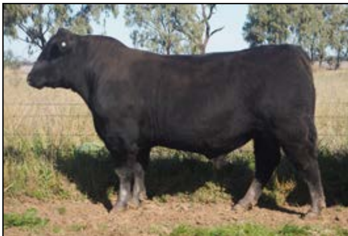
LOT 4- WAITARA MAKAHU R30