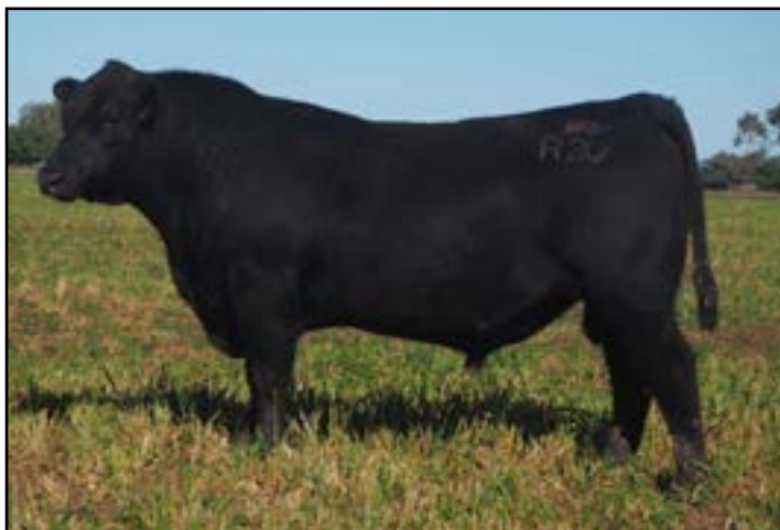
LOT 10- WAITARA GENERAL R20